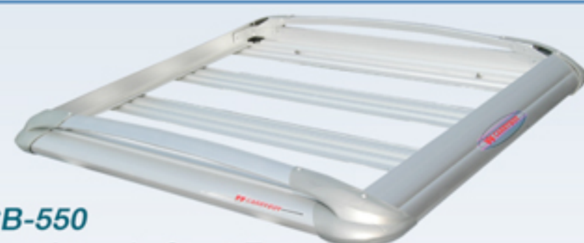
CB-550 Aerodynamic Sport Tray Aerodynamic design follows the contour of the vehicle. (Size 100x100 / 100x120 / 100x160 / 113x130 / 100x140 cm.)