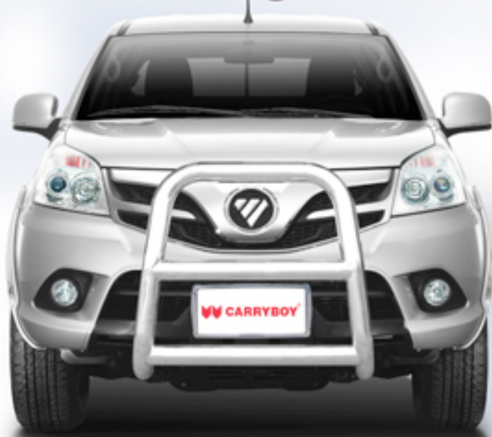
CB-544 A Bar Front Nudge Guard Produced from high grade stainless steel tube (TP 304) Ø 3" available to fit spot lamp 8"