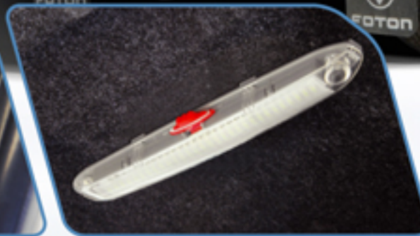
LED Interior Lamp