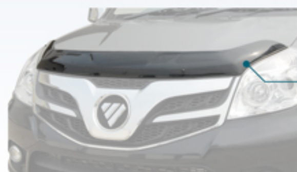
CE-982 Hood Deflector