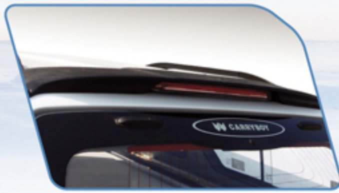
Spoiler with LED Break Light