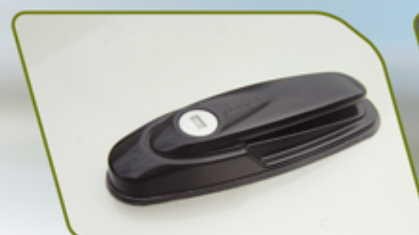
Metal Door Handle