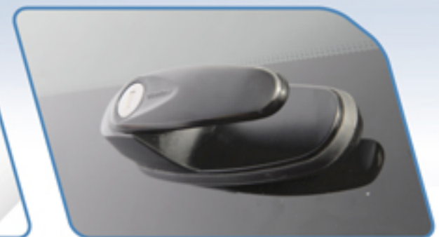
Rear Door handle