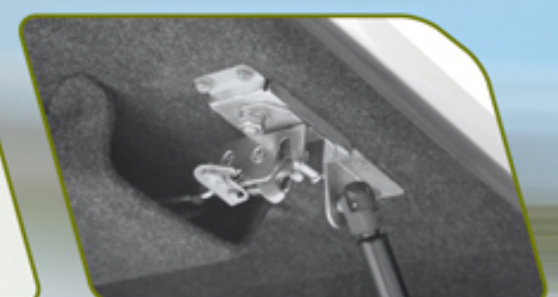
Slam Shut Locking