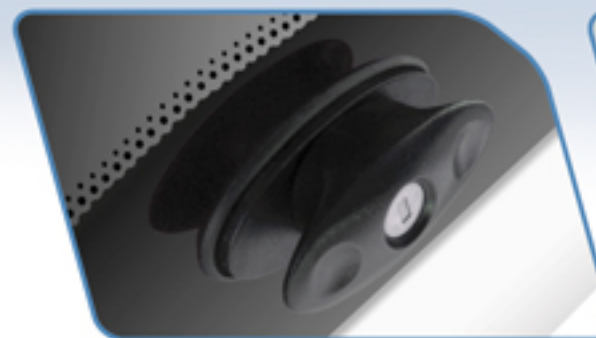
Side Glass handle