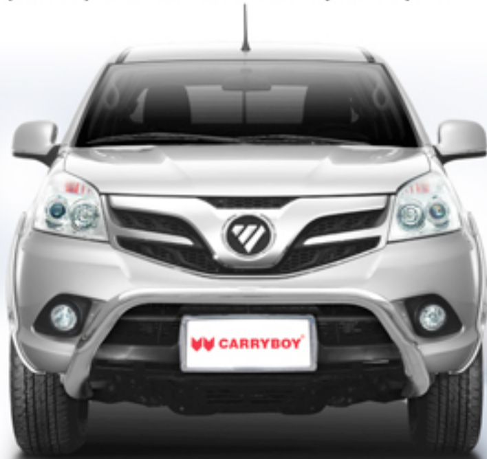
CB-780 Stainless Front Nudge Guard Manufacture a wide range of Stainless Steel Front Nudge Guard for pickup/truck. Provides rugged protection on and off the road premium grade stainless steel (TP 304) tube Ø 3"